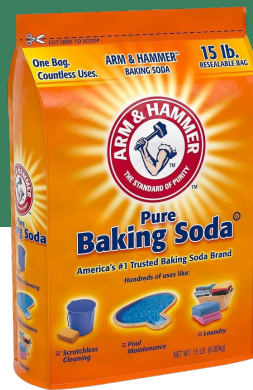
Arm & Hammer baking soda